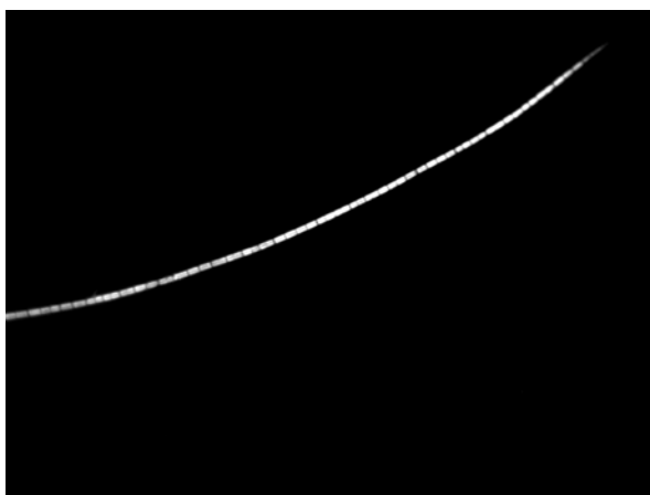
Fig. 4. Axenic filamentous, nitrogen fixing but noheterocystous, alkalo-tolerant (pH = 9,6) cyanobacterium (natural epifluorescence analysed with ImageJ software) isolated and purified by the improved lysosyme method.

In Figure 4 there is shown one cyanobacterial strain isolated in axenic culture.