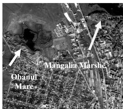
Fig. 1. The satelitary map of mesothermal sulphurous spring Obanul Mare (43°49'53.6''N; 28°34'05.3''E), placed near Mangalia Marsh – collection of cyanobacterial samples (www.GoogleEarth.com).

Study area and sampling. Cyanobacterial samples with contaminants were collected in May 2009 from sulphurous mesothermal spring (Obanul Mare) placed near Mangalia City (43°49'53.6''N; 28°34'05.3''E) (Fig. 1). The samples collected in sterile bottles were used to isolate cyanobacteria, by dilution and inoculation into conical flasks with either BG 11 media with different value of pH (Rippka et al. , 1979) or nitrate-free BG 11 media (BG 0 ) to isolate nitrogen fixing cyanobacteria, heterocystous or not.