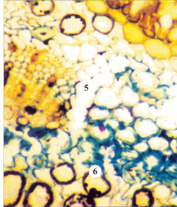
Figs. 5, 6. Semi thin cross section of Pinus nigra , Borzesti ( \times 170 ; \times 300 ): 1 – spongy space resulted from disorganizing of the tracheidal parenchyma cells; 2 – atypical bundle; 3 – tracheidal parenchyma cells containing phenolic compounds; 4 – assimilatory parenchyma containing phenolic compounds; 5 – spongy space; 6 – tracheidal parenchyma containing phenolic compounds.