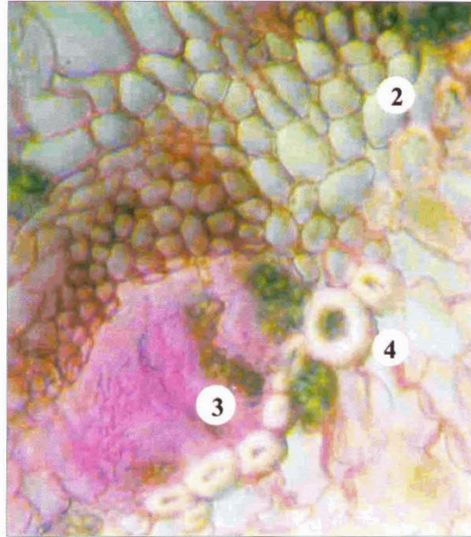
Figs. 3, 4. Cross section of Pinus nigra needle, Borzesti ( \times 300 ): 1 – oxaliferous cells in the tracheidal parenchyma; 2 – mechanical cells with very thick walls; 3 – phloemic parenchyma cells containing the crystals of calcium oxalate; 4 – mechanical cell.